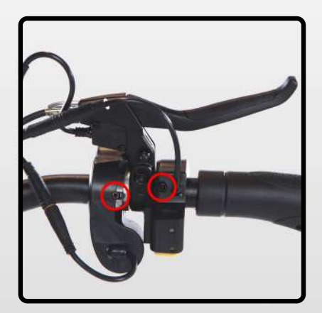
Make sure the voltage lock and light button screws are tightened.