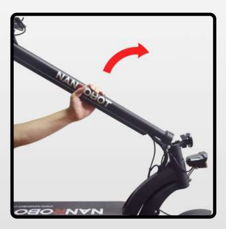
1 Push the handlebar in the direction of the arrow.