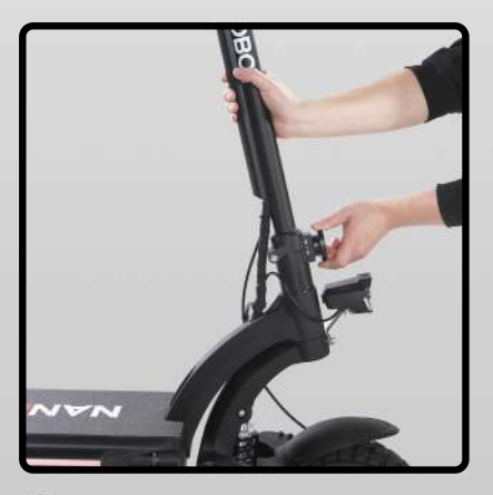
③ Make sure to perfectly align the ]-shaped buckle.