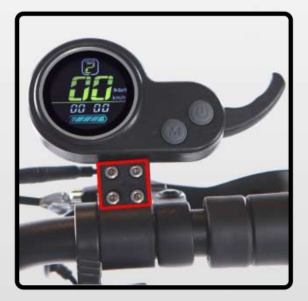
Check whether the LCD control panel screws are tightened.