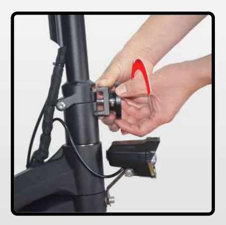
② Align the ] -shaped buckle with the grooves, then tighten the folding knob.