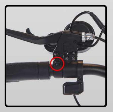
Check whether the brake lever screws are tightened.