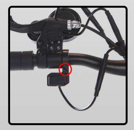
Check whether the SINGLE/DUAL button screws are tightened.