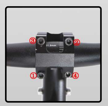
③ Progressively tighten the bolts in sequential order (1 to 4), ensuring equal tension balance between the mount and handlebar.