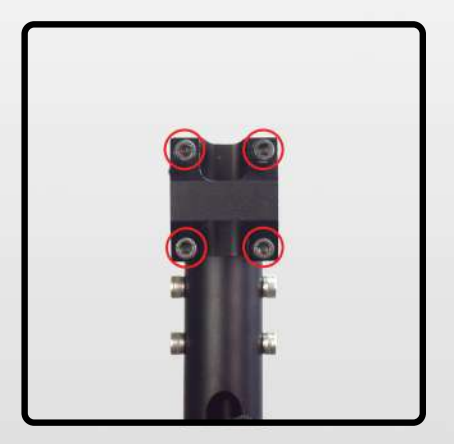
① Loosen the screws on the handle mount with a 4mm hex wrench, which is included in the basic tool kit.