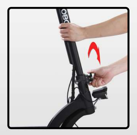
1 Loosen the knob in the direction of the arrow.