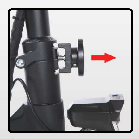
② Keep loosening the folding knob until the ] -shaped buckle completely leaves the grooves